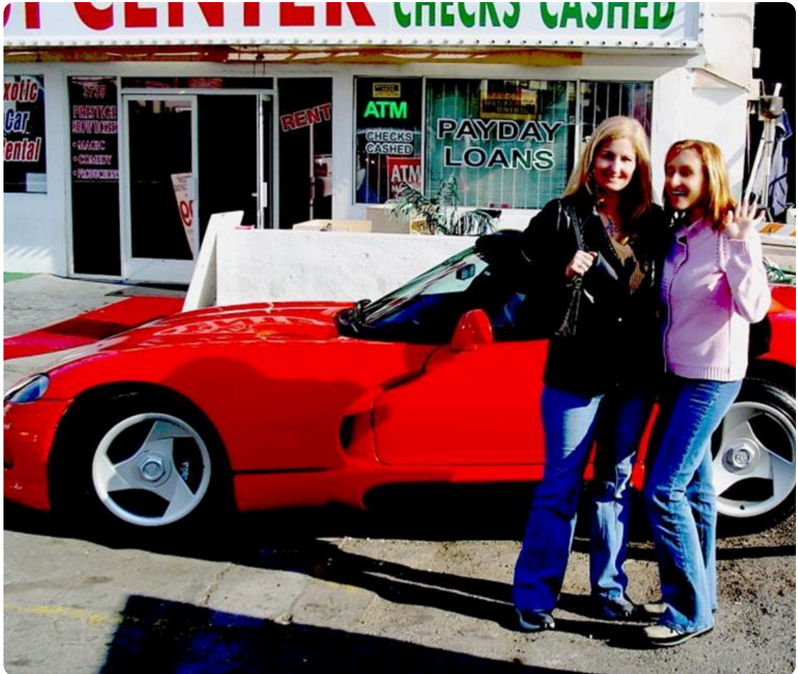
Our fun trip to LV...I will never forget